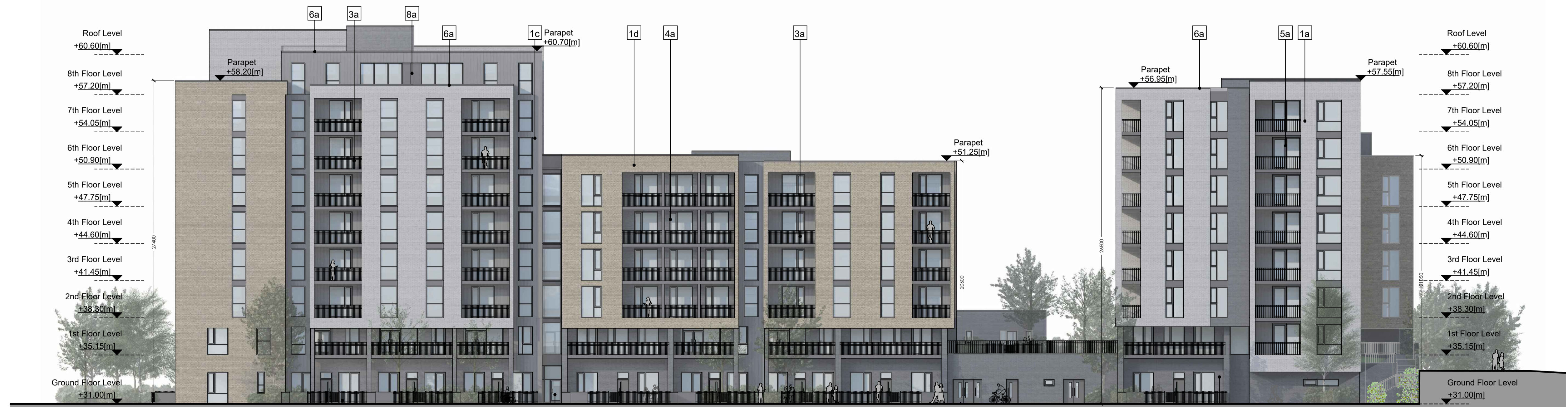
South Elevation - Block 6 Scale 1:200 @A1

WILSON ARCHITECTURE OMM | W 51 Patrick's Place, Wellington Rd., Cork t: 353-21-455255 e: info@wilsonarchitecture.ie 36 Pembroke Rd, Dublin 4 t: 353-1-6601866 w: www.wilsonarchitecture.ie